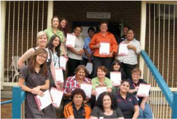
SmokeCheck workshop, Griffith, November 2010

Our 'travelling trainers' were busy in 2010 and after running 22 workshops last year we've now completed a total 106 workshops and trained almost 1000 people since the program began in 2007! We would like to take this opportunity to thank all of you who have attended the training and contributed to the success of the program. Help us hit the 1000 mark and register for a workshop today!