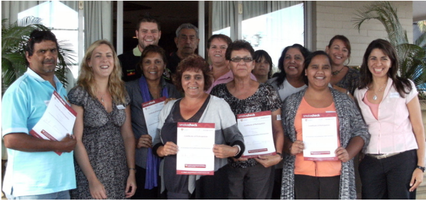
SmokeCheck workshop in Tamworth

Note: The contribution and attendance of health workers who smoke will be valued and is encouraged.